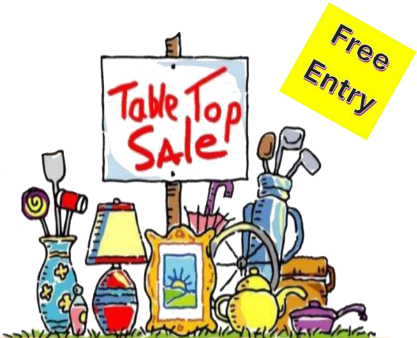
TABLE TOP SALE £10 per table

To book a table contact Jonathan Kingston on jonkingston54@hotmail.co.uk