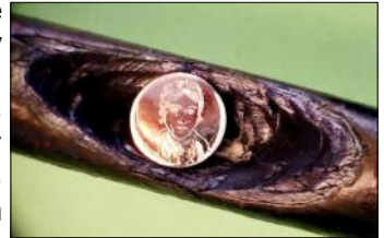
Portrait of artist JMW Turner, engraved on a speck of gold inside a hollowed-out hair

succeeded in 2010. This brought much publicity and fame, and he has gone on to produce numerous micro engravings on various minute items of gold or silver often set in the eye of a needle. He has engraved on the edge of medals, a 51-word poem on a 20mmx10mm pill, the smallest portrait of the late queen on a gold chip in the eye of a needle and a message on the edge of a safety razor.