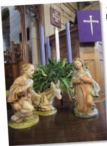
← DESIGN 4 Posada begins

Please use the form or email if you possibly can. Payment and delivery arrangements will be made when your order is being processed. If postage charges are incurred, these will be added at cost.